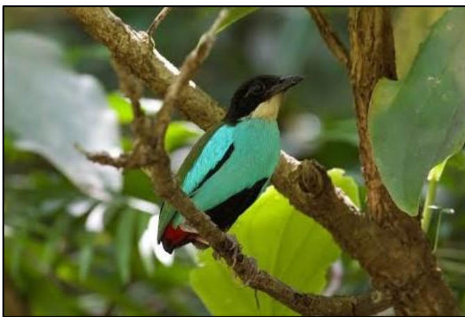
Steere's Pitta by Shailesh Pinto

The following morning, we awoke early to track down our targets here: Cryptic Flycatcher and Whiskered Flowerpecker. The flycatcher was seen close to our rooms, and a bonus was a beautiful Southern Silvery Kingfisher on a boulder-strewn stream. The hike up to the flowerpecker spot was steep but worth it, as we had very close looks at Philippine Falconet, Philippine Spine-tailed Swift, and great scope looks at the rare Whiskered Flowerpecker feeding in a fruiting tree here. Bicolored, Red-keeled and Orange-bellied Flowerpeckers were also noted, amongst other previously seen species. From here, we returned to the resort to grab our gear and drive to Bislig, 4 hours away. After a brilliant day, we retired for an early meal, as we had a very early start planned for the lowland forest of PICOP.