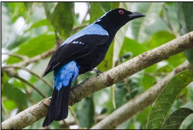
Asian Fairy-bluebird by Forrest Rowland

Our final morning on the island of Palawan saw us plying the roads and trail of the Irawan. The site is well-known for Melodious Babbler and Palawan Flycatcher – both of which we encountered. We also had close encounters with Red-headed Flameback, Asian Fairy-bluebird, Philippine Cuckoo-Dove, Hooded Pitta, Ruddy Kingfisher and more Blue-headed Racket-tails. After this success, we headed back to our hotel, first stopping at some rice paddies, where I ran between the fields flushing a Greater Painted-snipe, Yellow and Cinnamon Bitterns, and at least three Watercock! We then flew to Manila and fought traffic back to the Heritage Hotel, ready for our next adventure.