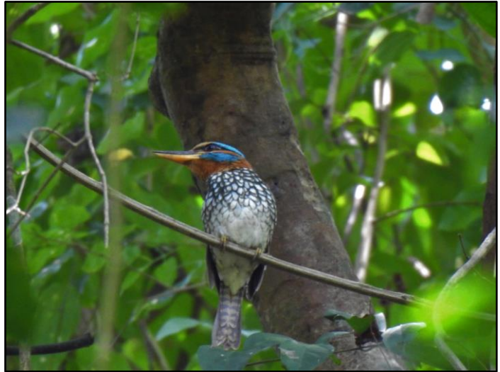
Spotted Wood Kingfisher

Mavis. We barely played a few seconds of the recording when a Spotted Wood Kingfisher came screeching in and perched openly for great views. After this success, we walked down the paved road of Mt Makiling, picking up Amethyst and White-eared Brown Doves and a further two Spotted Wood Kingfishers, and listened to the haunting call of the White-browed Shama. After lunch, at the Botanic Gardens, we had brief looks at the smart Red-crested Malkoha. We returned to the farm for more buttonquail views, picking up the endemic Spotted Buttonquail in the scope as it crossed the track. In the surrounding fields, we saw many Striated Grassbirds, Glossy Swiftlets, Coppersmith Barbets, Golden-headed Cisticola, Lesser Coucal, Stripe-headed Rhabdornis and Blue-tailed Bee-eaters.