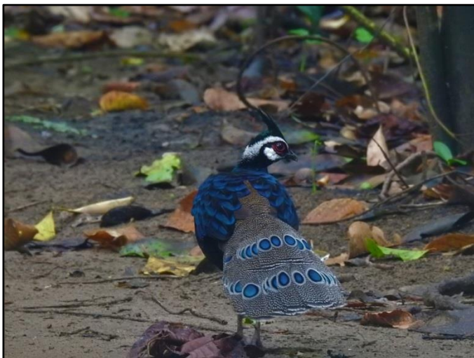
Palawan Peacock-Pheasant by Erik Forsyth

For the morning of our first full day of birding, we started with breakfast at our well-appointed beach hotel in Sabang, before taking the short drive to the boat dock in town. From there, we boarded a small boat and undertook the 20-minute journey to the headquarters of St Paul's Underground River National Park. Timing our arrival to precede the hordes of tourists to come, we had enough time to wander around in relative peace, and it wasn't long before we had found our main target, the spectacular Palawan Peacock-Pheasant. We enjoyed ten minutes with this beauty before it sneaked off back into the forest. Wow! In addition to this, we had at least two pairs of Philippine Megapodes, territorial White-vented Shama, a showy pair of Palawan Blue Flycatchers, a wonderfully obliging pair of Ashy-headed Babblers, gaudy Hooded Pitta were showing well, a brief encounter with a striking Ruddy Kingfisher and close encounters with Long-tailed Macaques and Monitor Lizards.