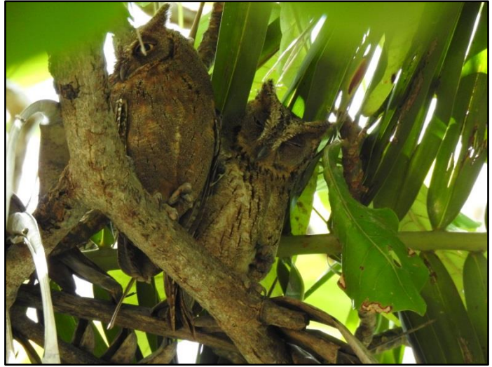
Mantanani Scops Owl by Erik Forsyth

It was a pleasant journey with calm seas. On arrival on the picturesque island, we met a local guide and walked a mere 100m to a large tree to view the Mantanani Scops Owl – our reason for visiting this island. We also took a walk around the island, and at a small beach we enjoyed great scope looks at Grey-tailed Tattler, Grey Plover and Terek Sandpiper. Best of all was a lone Chinese Egret perched at the top of a mangrove tree. This was a great find, as most birds had left for their breeding grounds on the Chinese mainland. In the late afternoon, we headed back to our hotel for a relaxing evening.