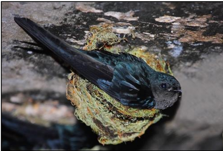
Glossy Swiftlet by Keith Valentine

Our day up Kanla-on was action-packed. We drove up the mountain in 4x4s; and at a good elevation, we hopped out and started birding. First off, we had excellent looks at Blue-crowned Racket-tails and a