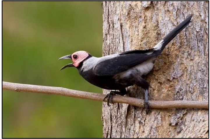
Coleto

The Subic Bay area provides some of the easiest and most enjoyable birding on our tour, and we thoroughly enjoyed our morning there – not to mention a little time off! We found a host of target endemics and specials, but we were also able to get numerous better looks at previously seldom-seen species, such as the bizarre Coleto. During our walks here, we had excellent looks at several Green Racket-tail, a flock of Rufous Coucal, Sooty and the huge White-bellied Woodpeckers, Luzon Flameback, Philippine Hanging Parrot, Philippine Coucal and Trilling Tailorbird. A clear highlight was a perched Philippine Hawk-Eagle, which stayed long enough for exceptional views.