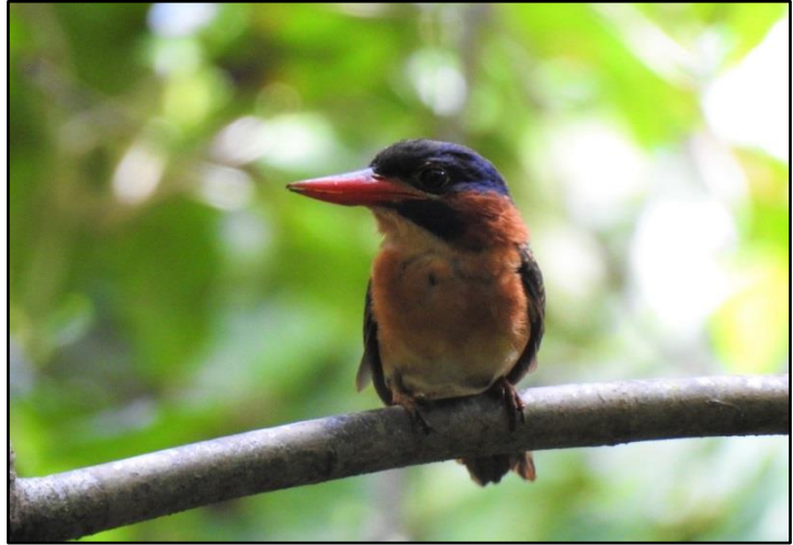
Hombron's Kingfisher

It was towards the end of our third full day in PICOP that we saw one of the rarest and shyest forest birds. We were listening to a call of the Streaked Wren-Babbler and peering into the forest understorey for a view, when the rustling of leaves not far from us suddenly materialised into a bird flushing and landing on a horizontal branch nearby. We were all looking at a Mindanao Bleeding-heart! A species heard more often than seen. Although the forest of PICOP was heavily logged, there was still good birding to be had.