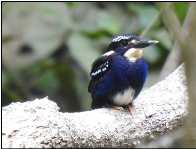
Northern Silvery Kingfisher, Bohol

We started our full day on Bohol back at the Rajah Sikatuna NP, and went on to visit nearby rivers, roads and even the Chocolate Hills for lunch. Birding was slow for the most part, but we did end up with a respectable list containing most of the special endemics we had come for. On our walk this morning, Samar Hornbill, Philippine Hanging Parrot in the scope, Bohol Sunbird, Philippine Drongo-