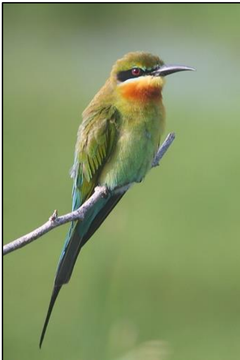
Blue-tailed Bee-eater by Keith Valentine

In the late afternoons, we visited the Bislig Airport wetlands. It was awesome! Yellow, Cinnamon, and Black Bitterns, Greater Painted-snipe and White-browed Crake in the canals, Wandering Whistling Duck and the endemic Philippine Duck flying over the marsh, Golden-headed Cisticola, Lesser Coucal, our only Pink-necked Green Pigeons, Little Ringed Plover, and great flight views of King Quail as they flushed ahead of us were all noted. Eastern Grass Owl was picked up before dark and this rounded off a fabulous day's birding. Night birding at PICOP was very difficult due to the 4:45 AM sunrise (requiring a 3:00 AM departure from Hotel); and even then, we had travelled only an hour to the nearest patch of forest. Although we did not see any owls, only hearing Mindanao Hawk-Owl and Giant Scops Owl, we pulled back the Philippine Frogmouth (missed on Mt Kitinglad), which landed on a branch nearby, showing really well.