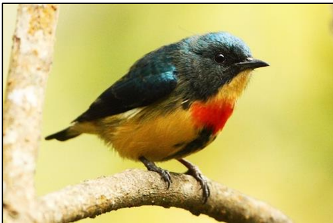
Fire-breasted Flowerpecker by Markus Lilje

We ate lunch here while watching the eagle, and then slowly headed down, birding en route. The skies were dark behind us, and half-way back we found shelter under a building on stilts as the skies opened up, again. Torrential rain fell, and we were happy to be undercover. After an hour, the rain subsided and we headed back down the mountain to our lodge. Night birding again produced Philippine Nightjar and the Bukidnon Woodcock showed well, flying past the camp a few times. Later, the Giant Scops Owl was heard calling but again failed to show.