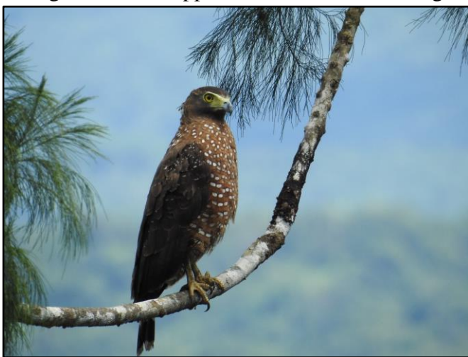
Philippine Serpent Eagle by Erik Forsyth

We arose early the next morning with House Swifts and Striated Swallows active outside the hotel windows. After a quick breakfast, we loaded up and headed to the summit of Mt Polis. One of the first species to show was a Philippine Bush Warbler, followed by a few of the more common species, including Chestnut-faced Babbler, Negros Leaf Warbler, Mountain White-eye, Luzon Sunbird and Turquoise Flycatcher. We also had brief looks at Tawny-breasted Parrotfinches, a scarce bird throughout the Philippines. Overall, the morning was fairly productive. The afternoon was slow, but we