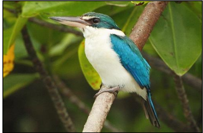
Collared Kingfisher

After lunch, we began our drive to Sabang, birding at a few stops along the way. Highlights of these stops included: Palawan Flowerpeckers, a pair of Copper-throated Sunbird, Lovely Sunbird, Yellow-throated Leafbird, Asian Fairy-bluebird, noisy Blue-naped Parrots, Dark-throated Orioles, Sulphur-bellied and Palawan Bulbuls, Square-tailed Drongo-Cuckoo and Fiery Minivets. In the late afternoon, we had reached the Cockatoo Lookout Point where a Barred Buttonquail was seen briefly. Here, we had our first Chestnut-breasted Malkoha, Palawan Hornbills and at least seven of the highly endangered Red-vented Cockatoo flew past and landed a few hundred metres away. Bird of the day, undoubtedly, went to the Falcated Wren-Babbler that commenced to sing in full view not 10 metres away and slowly came closer! As it was late, and the weather was good, we decided on trying for nocturnal birds. This proved successful, and we eventually had excellent looks at Palawan Scops Owl and the bizarre looking Palawan Frogmouth. A delighted group then headed to our hotel for dinner and bed.