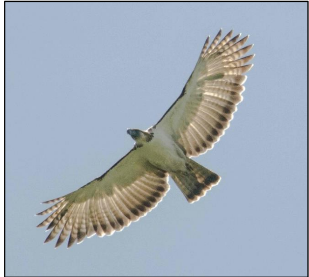
Philippine Eagle by Forrest Rowland

The following morning, after breakfast, we hiked up to the “Eagle Viewpoint”. A clear sunny day and lots of birds. It was here that we encountered our first montane mixed flock of the tour! Sulphur-bellied Nuthatches, Negros Leaf Warblers, Elegant Tits, Mountain White-eyes, Little Pied Flycatcher, and Black and Cinnamon Fantails! We also found Short-tailed Starlings attending nest holes, though we also added many more specials to the list. Most significant of these – for some – of course, was the Philippine Eagle seen within the first few hours of our arrival at the viewpoint on our first morning. At first, it was far away, flying on a hillside, and later perched on a distant tree. We were elated and enjoyed scope views of its crest blowing in the breeze!