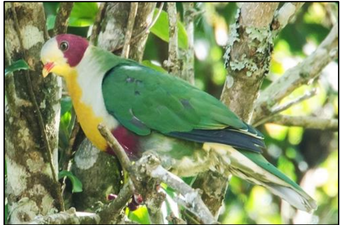
Yellow-breasted Fruit Dove by Forrest Rowland

On our last morning, we searched near the camp for Yellow-breasted Fruit Dove and Rufous-headed Tailorbird. We hiked a small trail near our camp and, soon after, heard the dove calling nearby. After a search, we located the bird and enjoyed fabulous scope views of this highly colourful bird. We then hiked back down the mountain, picking up the tailorbird en route. From here, we travelled to Eden Mountain Resort – a 3.5-hour drive away from the base of Kitinglad . We arrived at this foothill site in time to get rained out of afternoon birding. After an early dinner, the hot water and amenities were welcomed – especially after three nights of camping .