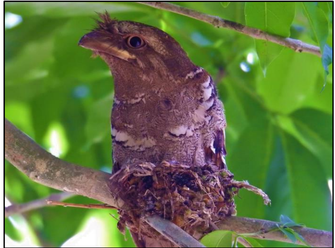
Philippine Frogmouth on nest